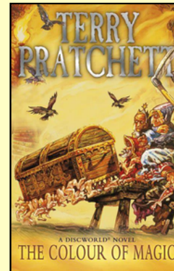
The Colour of Magic Terry Pratchett