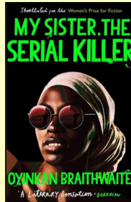
My Sister, The Serial Killer Oyinkan Braithwaite