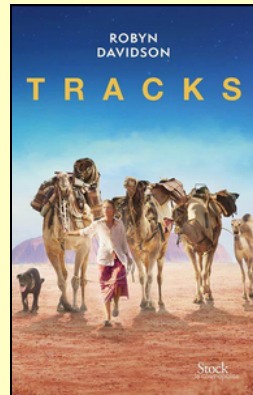
Tracks Robyn Davidson