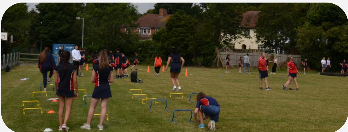
Team obstacle challenges during STEM day—read on for more information...