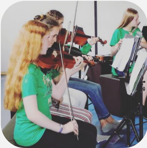
Lots of pictures are available on the music Instagram page: @BFS_Music