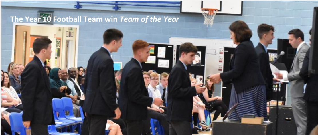
The Year 10 Football Team win Team of the Year