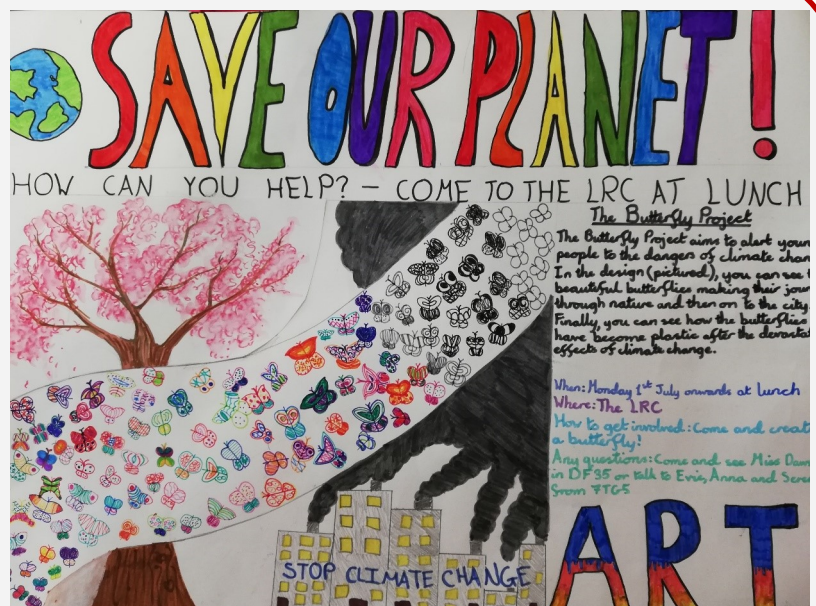
A project created by Anna Sheldon, Evie Bush and Seren Jones in 7TG5

The artwork will show a group of butterflies flying past a giant tree and then on to some factories that are producing masses of smoke. These buildings show what our planet is destined to look like if we do not take immediate action. The butterflies start off as colourful, but slowly fade out to black and grey and finally you will see a few plastic butterflies to represent death and destruction caused by climate change and the pollution plastic is causing in our society. We will be launching the project next Tuesday at lunchtimes until the end of term in the LRC and welcome everyone who wants to get involved.