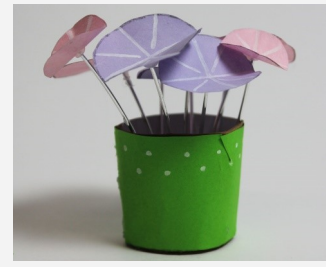
Tally Jenkins 7TG3