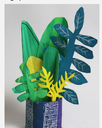
Caspar Goslin 7TG1