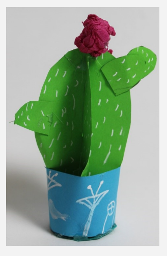
Alp Preston 7TG7

Take a look at the Art Club notice board in D block to see more photographs of their outcomes.