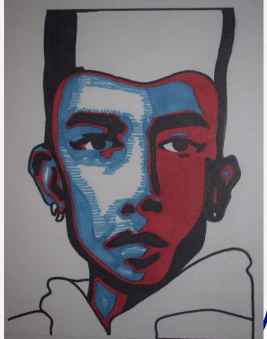
Damian Semmence, Y13 Pen and ink drawing