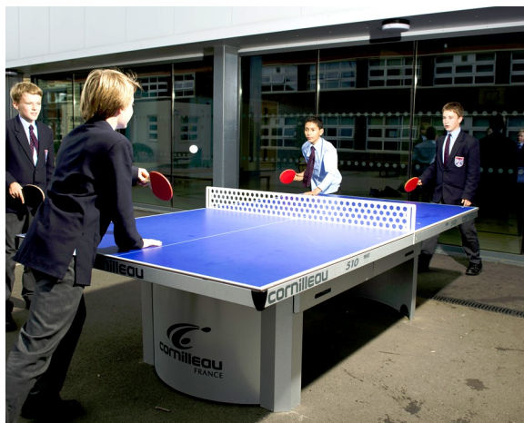
Pictured, left, is one of the table tennis tables that we bought last year.

Some of the equipment we have funded includes two outdoor table tennis tables, resources for the Duke of Edinburgh programme, plus most recently a pool table for the new 6th form block.